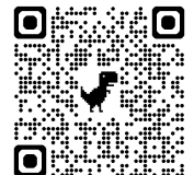
Grief Share Small Group