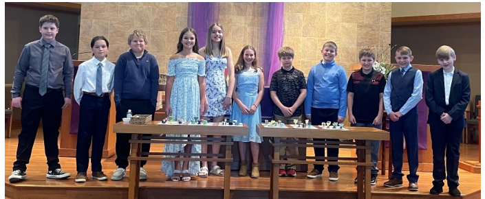
First Communion Class of 2025

We celebrated this wonderful group of students' First Communion during worship on Sunday April 6th! Students at St. John's have a long tradition of making their own cups, they also make bread and participate in a Seder meal to learn more about this special meal and faith milestone.