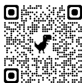
Grief Share Small Group