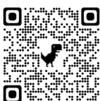
Altar Echo Text Study