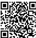
Altar Echo Families