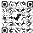
Altar Echo Text Study

can be a great way to pique your curiosity about the upcoming Sunday's Scripture reading. Because this podcast includes multiple pastors, you get added