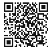
Altar Echo Families