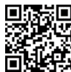
Sunday School Registration