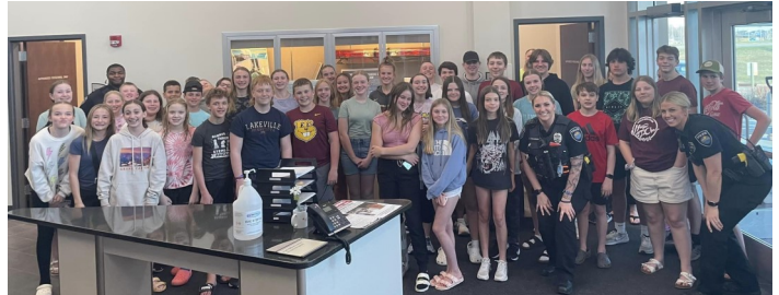
Affirm Youth at the Fall Service Blitz

This year, we will be using a curriculum developed by Lutheran Social Services of MN and Cherish All Children to explore what it looks like to have safe and healthy relationships as youth in our world today, including online safety and making a safety plan in your family.