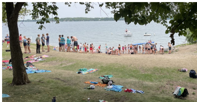
On the beach at Luther Crest

If your student is interested in Summer Camp, please email Amanda, there are a few openings in some of the programs. amanda@sjlcl.org